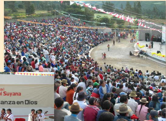
A full house and a great atmosphere at the celebration

Thanks were extended to them and to the "Jesus.de" website that had collected a large part of the finances needed. Could there be a better project of international cooperation?