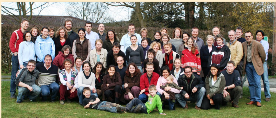
▲ Their faces say it all – a highly motivated group, full of enthusiasm

the year the team in Peru will have grown to 20 volunteers.