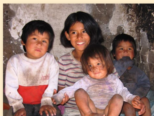
Indian children in their hut about a mile from the hospital