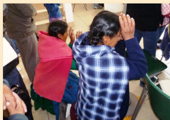
Two Quechua women praying in the hospital church