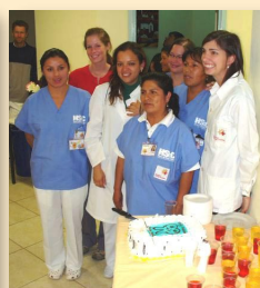
▲ Happy staff members and a sweet birthday cake