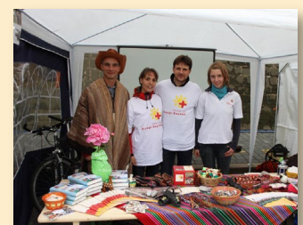
▲ Diospi Suyana activists