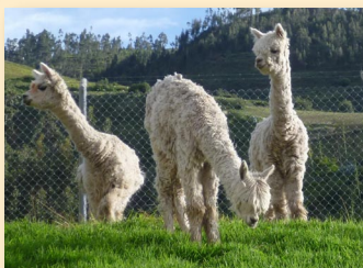
Michael Mörl bought 4 alpacas as lawn mowers for the hospital