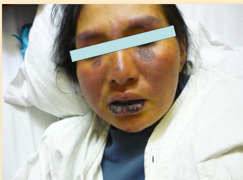
▲ Patient in her hospital bed