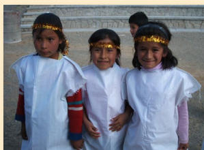
Indian girls at the Diospi Suyana Christmas celebration on December 2.

Diospi Suyana - USA P.O. Box 961 Jenison, MI 49428