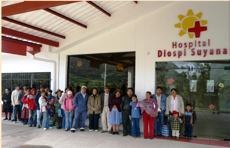
▲ Patients waiting at the hospital's main entrance.

We are excited about the high numbers of patients we have been seeing in our out-patient departments. At present, approximately 75 people are making use of hospital services each day. As soon as the 15th container arrives with the x-ray equipment we will be opening our wards and operating theaters. We then expect a significant increase in the number of patients. Our international staff has grown to 66 members.