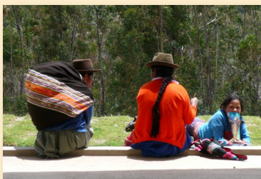
Quechuas at the hospital door

Diospi Suyana - USA P.O. Box 961 Jenison, MI 49428