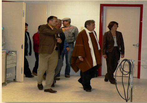
▲ The Minister goes onto the ICU

March 5th will go down as a milestone in the history of the mission hospital. At 11 p.m. the convoy of Minister of Health Sr. Garrido Lecca pulled up. Actually the flying visit was only supposed to last 30 minutes, but every-