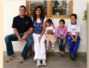
▲ A special place in our affections