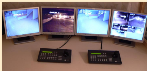
▲ Total overview on the monitors